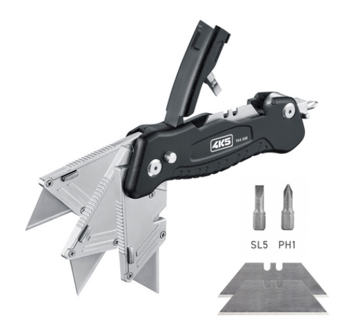
TKX 310, 3 blades