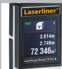
Illuminated colour LCD

* See operating instructions for specific accuracies