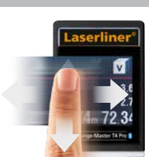
Touch screen for switching functions