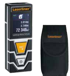
LaserRange-Master T4 Pro inclusive softbag