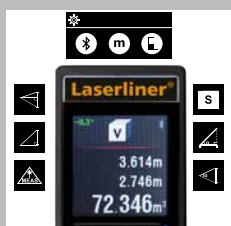
Multi purpose functions