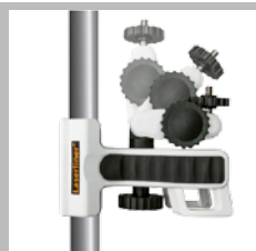
Adjustable and free mounting options