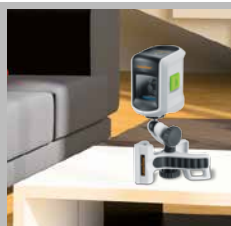
FlexClamp Plus with base support