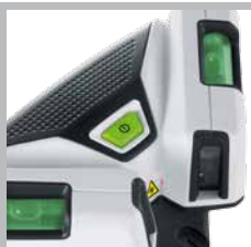
Bubble levels to adjust the device