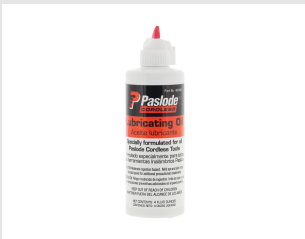
Eurocode 401482 Impulse Lubricating Oil