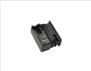
Eurocode 018881 Battery charger for Impulse lithium tools EU