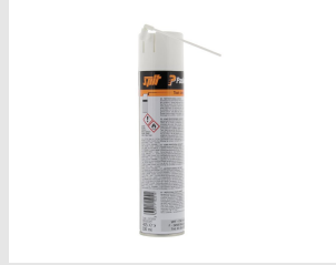
Eurocode 115251 Impulse Cleaner 300ml