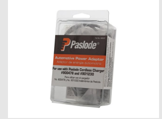
Eurocode 900507 In-car Charger Adaptor