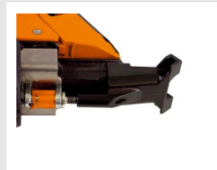
Eurocode 013221 Tongue & Groove Probe