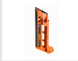
Eurocode 013224 Standard Magazine for IM90i