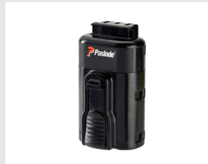
Eurocode 018880 Li-ion Battery for IM360Ci / PPN35Ci / IM350+ / IM65 / IM65A / IM50