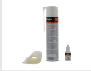
Eurocode 013690 Impulse & Pulsa Cleaning Kit