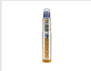
Eurocode 300348 SERIES-i Fuel Cell Blister Pack