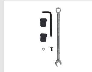
Eurocode 013256 No-Mar Cladding Probe Rubber Tip