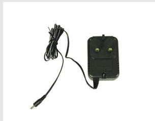
Eurocode 900505 230V AC / DC Adaptor - EUR