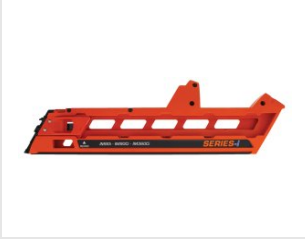
Eurocode 013225 Long Magazine for IM90i / IM360Ci