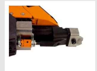
Eurocode 013223 Steel Tile Probe